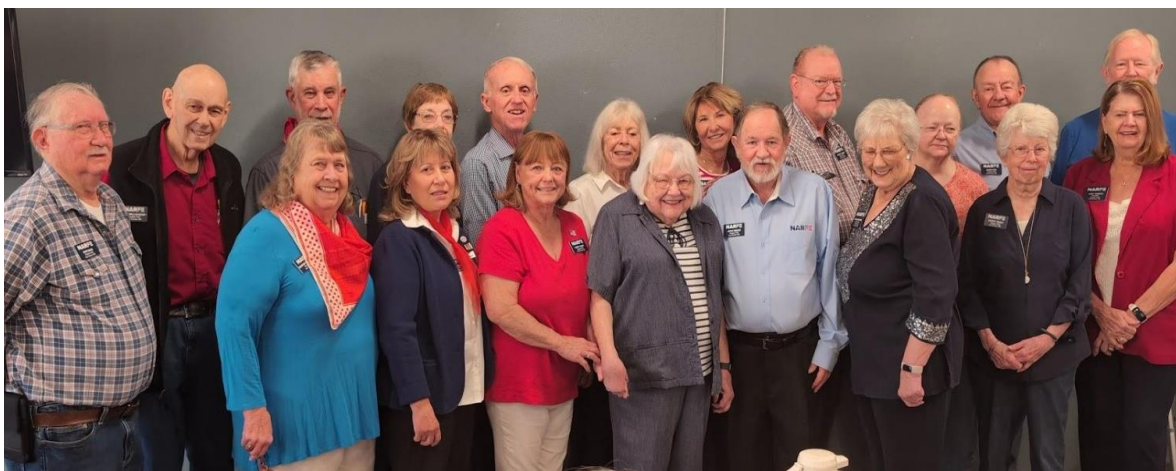
Las Cruces NARFE Chapter 182 Executive Board Members

Facebook: https://www.facebook.com/NARFE.LasCrucesChapter.182